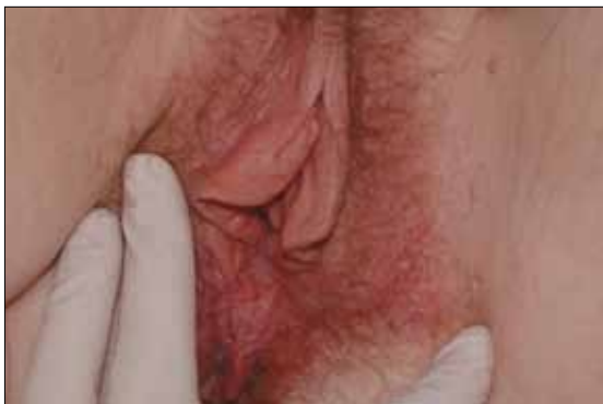
Figure 2. Candidiasis