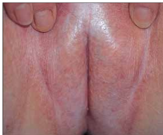
Figure 6. Late lichen sclerosus